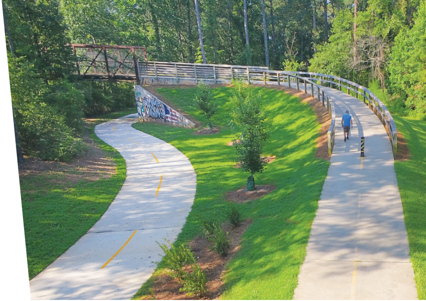
Extended Peachtree Creek Trail closer to Emory.