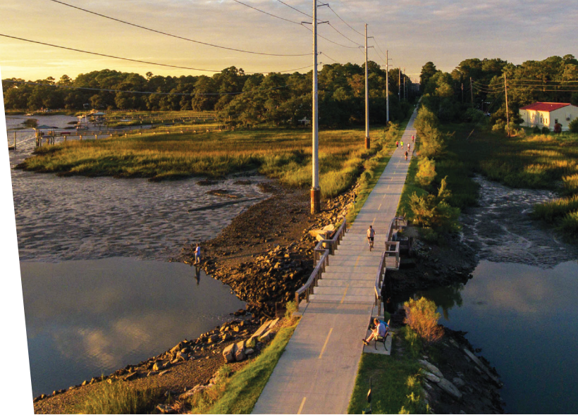
Finished two phases of Spanish Moss Trail; now 11 miles long.