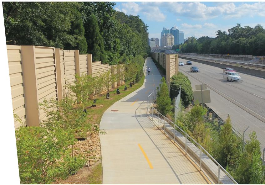
Completed two additional phases of PATH400.